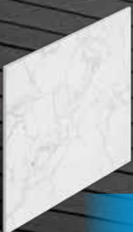
Ceramic Tiles Size 30x30 cm